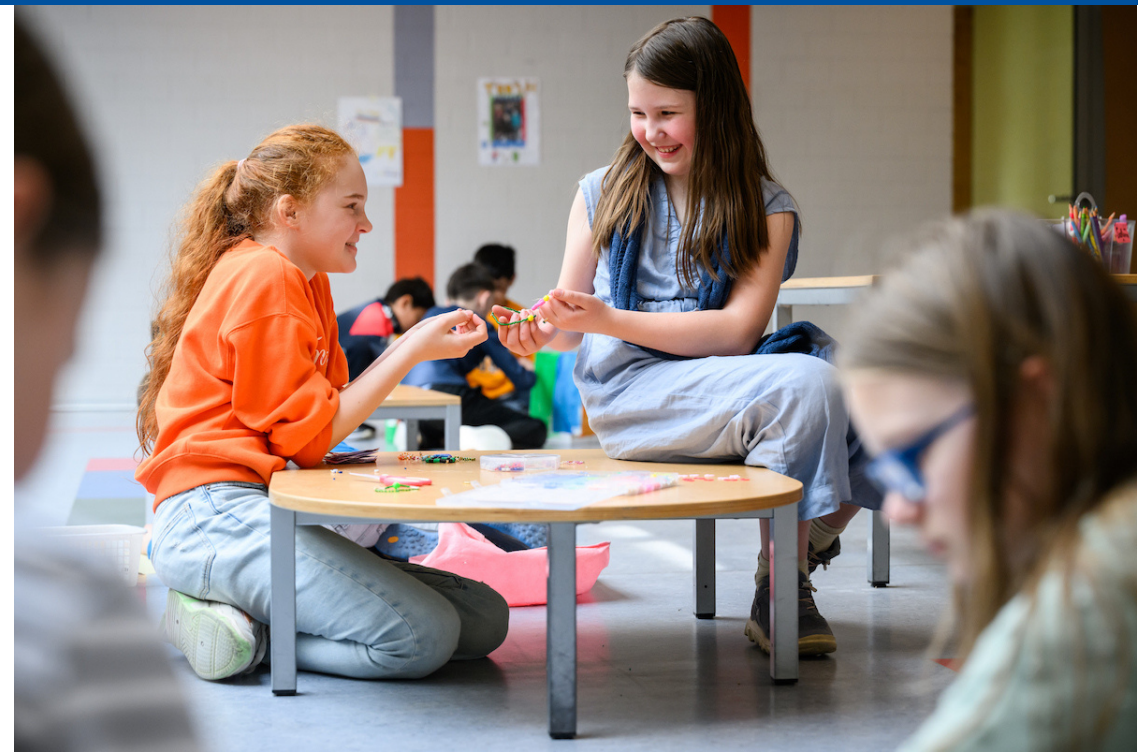
Breakout Seating Areas for Primary & Secondary School

Contribute to the realization of these two projects!